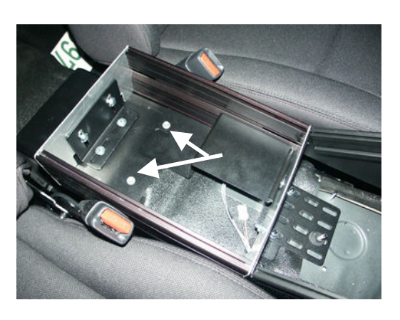
Attach rear floor filler panel (#6) to vehicle using OEM hardware